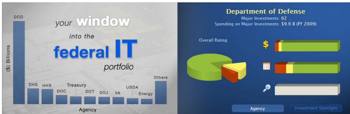
Figure 2: Federal IT Dashboard (OMB, 2009)

Influences from the White House Office of Management and Budget over the past decade have caused federal program management approaches to evolve considerably. In the same way that program management techniques originated in the public sector and then spread outward into the larger landscape of private business management, program management metrics are now trickling out into the public record and changing the ways in which laypeople can evaluate federal spending.